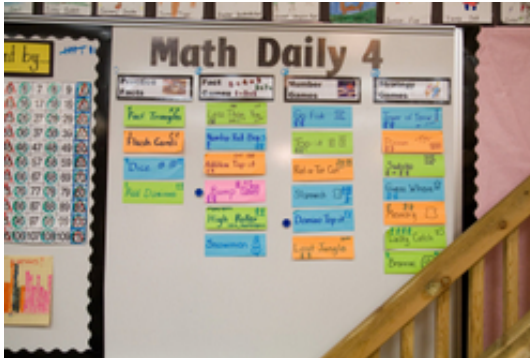
Long "sticky notes" make posting math games and activities a breeze - no tape necessary.

Our math area is separate from our literacy area. Not having enough bulletin board space for both, we adapted a white board to hold the math lessons and tools. The calendar ritual pieces are held together visually by surrounding them with a black border.